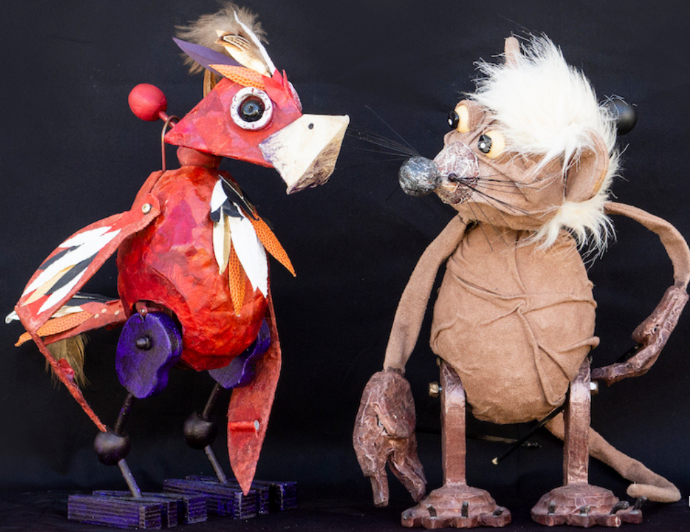
Photo from WP Puppet Theatre's Bakster & Bird